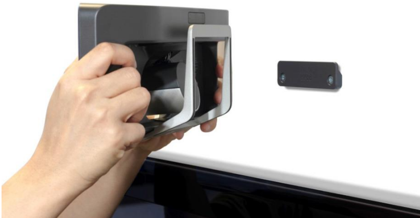
Figure 3. Cisco SX10 Wall-Mount Solution