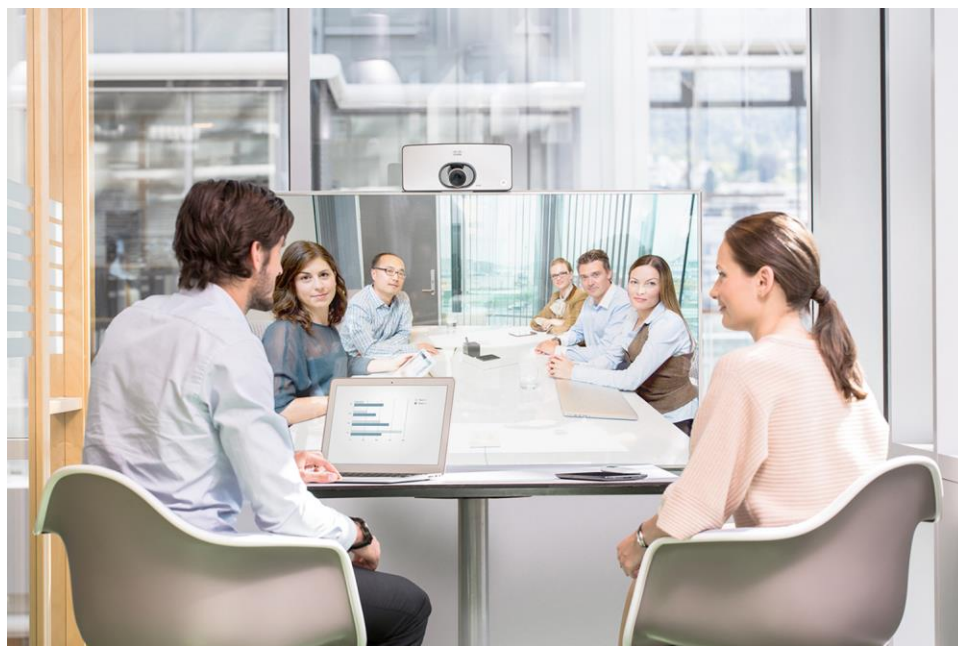
Figure 1. Cisco SX10 Quick Set in a Huddle Space

High quality, simplicity, and affordability come together in the SX10 Quick Set to create a practical and powerful business class solution for video ubiquity (Figures 1 through 3).