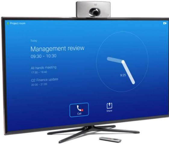
Figure 2. Cisco SX10 Quick Set Mounted with Remote Control